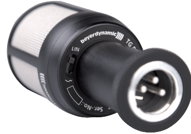
LIN / EQ switch at the bottom