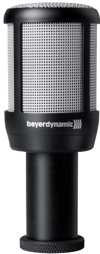
TG D50d with MKV 99 microphone clamp